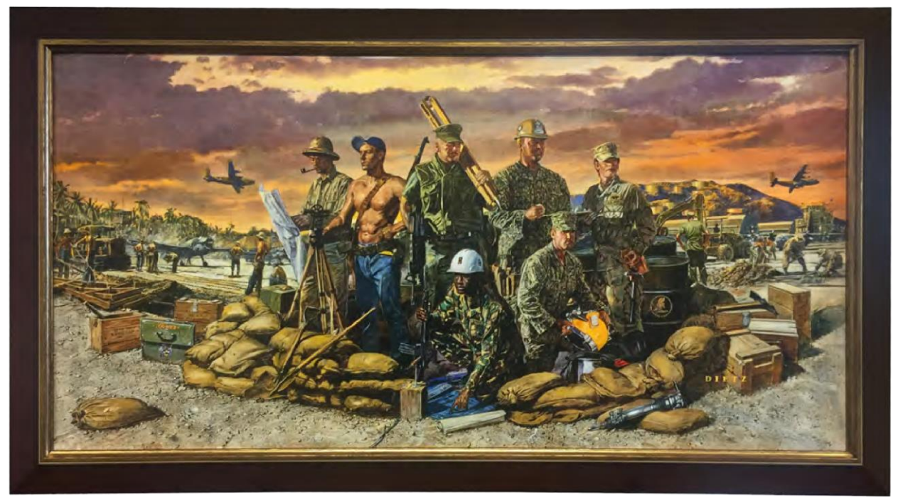
Above is an example of the Giclée print in a walnut with gold lip frame.

"WE BUILD, WE FIGHT" was created in celebration of the 75th Anniversary of the U.S. Navy Seabees occurring 5 March, 2017.