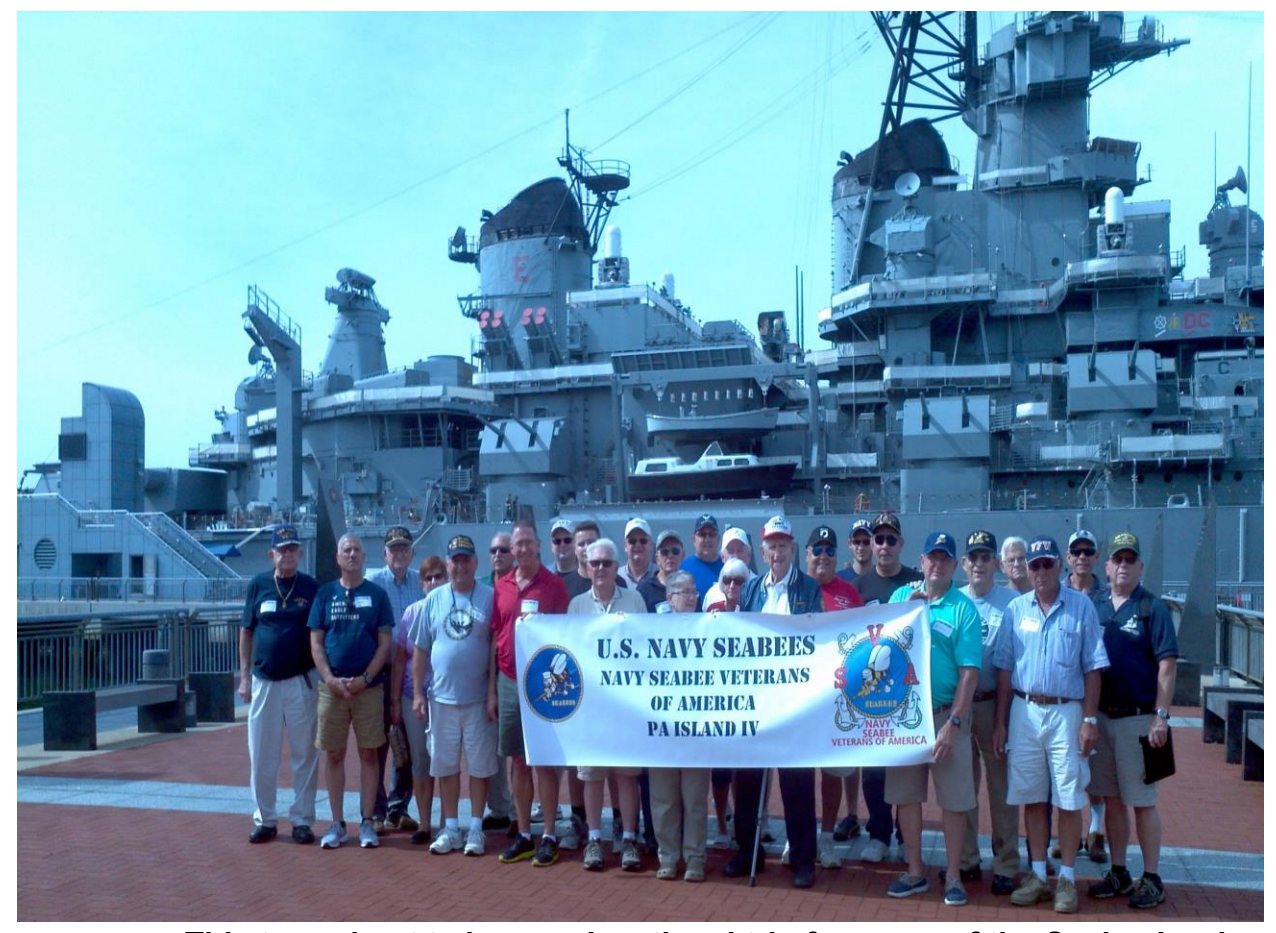
This turned out to be an educational trip for many of the Seabee's who were never on a ship, and a reminder of our Naval Heritage

trip to the USS New Jersey BB-62, in Camden New Jersey just up the river from where she was built at the Philadelphia Ship Yard.