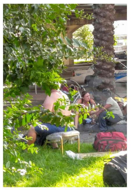
Tour of New Orleans